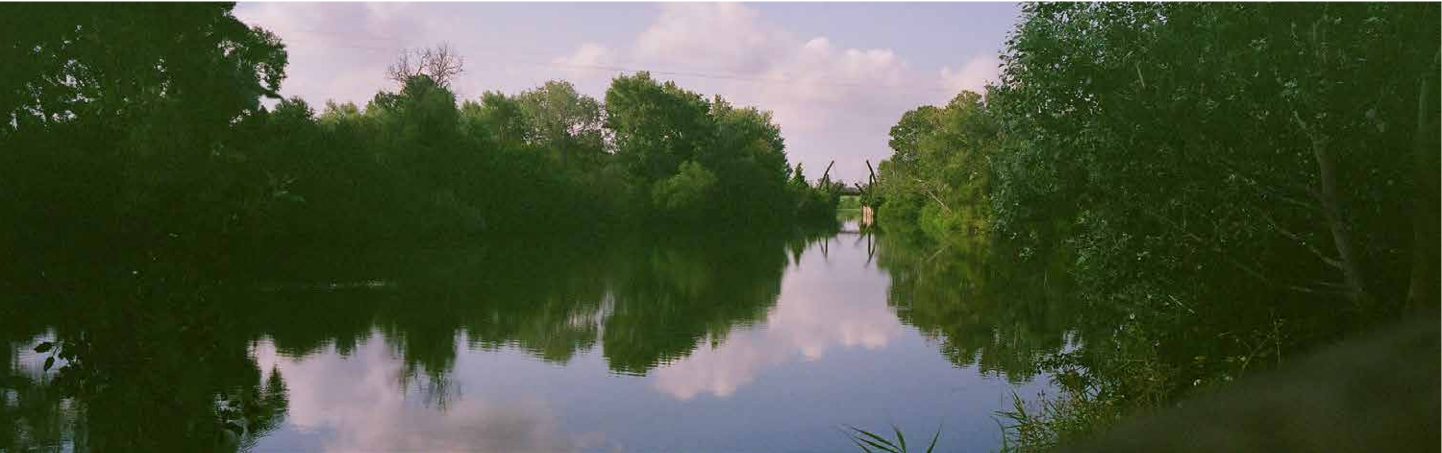
The Van Gogh Bridge, Arles, France

“Love many things, for therein lies the true strength, and whosoever loves much performs much, and can accomplish much, and what is done in love is done well.” — Vincent