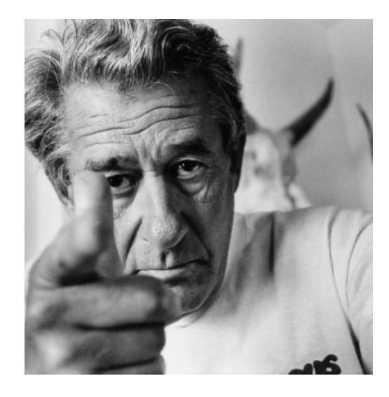
Helmut Newton : The Bad and the Beautiful AUGUST 27, 2020