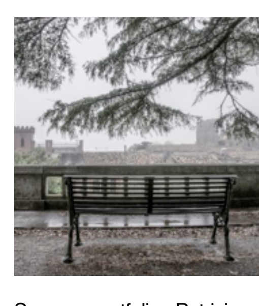
Summer portfolio : Patrizia Galia AUGUST 26, 2020