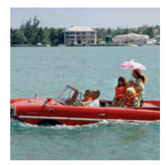
Staley-Wise Gallery : Summer AUGUST 27, 2020