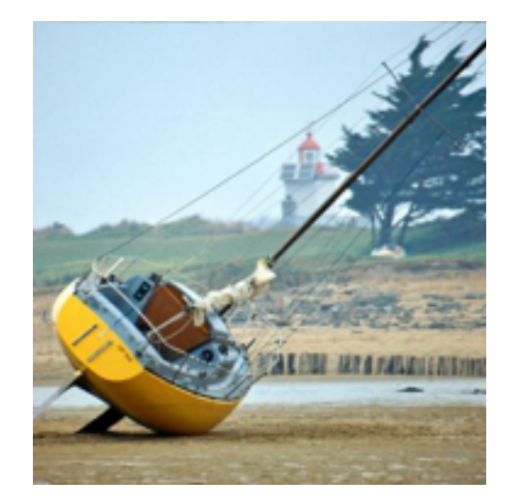
Summer portfolio : Pierre-Yves Rospabé AUGUST 26, 2020