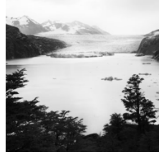
Summer portfolio : Felipe Schiffrin AUGUST 26, 2020