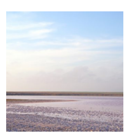
Summer portfolio : Svitlana Moiseienko AUGUST 26, 2020