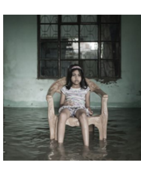
Arles 2020 : Open Walls : Some Portraits AUGUST 27, 2020