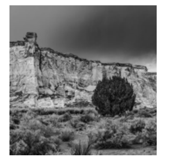
Staley-Wise Gallery : Priscilla Rattazzi : Hoodooland SEPTEMBER 16, 2020