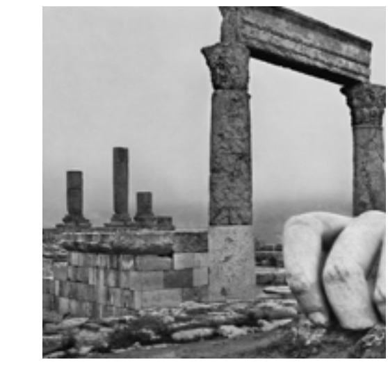
BnF : Joseph Koudelka : Ruines SEPTEMBER 16, 2020