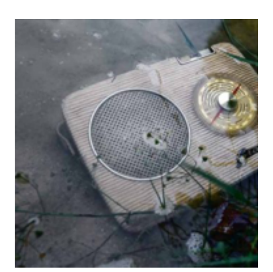
Thierry des Ouches : Silences